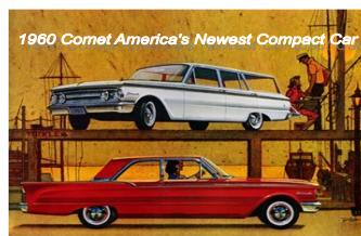
Comet 1960 thru 1977