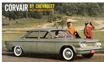
Corvair 1960 thru 1969