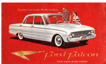
Falcon 1960 thru 1970